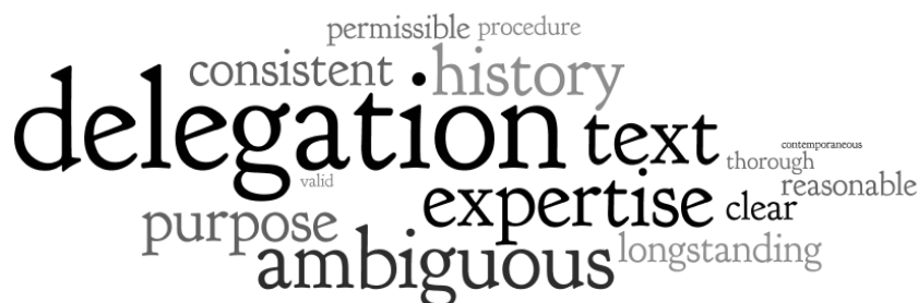
Figure 2. The Word Cloud.

Justice Breyer's many opinions on the matter clearly espouse this approach. Recall, for example, his claim in Christensen that Chevron did not alter Skidmore but merely identified delegation as an additional factor to consider. 120 He also insisted in Barnhart that Christensen did not absolutely prohibit Chevron deference for the listed informal guidance, and that factors like subject matter and statutory complexity are at least as important as the procedures the agency followed. 121 Some of Justice Breyer's other opinions follow a similar theme.