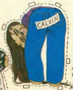
Baby Brooke Bear (contort Basic Bear to fit Baby Brooke)