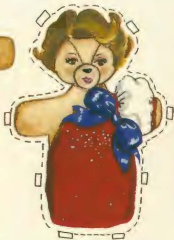
First Lady Bear