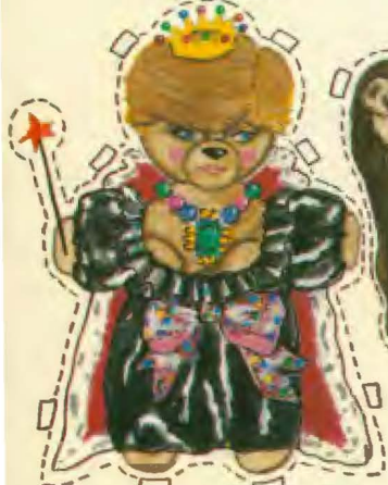
Princess Di Bear