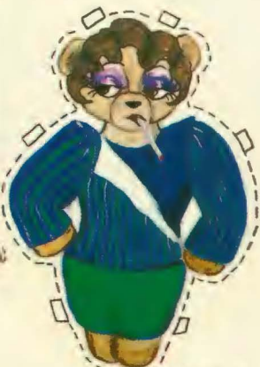
Bette Davis Bear