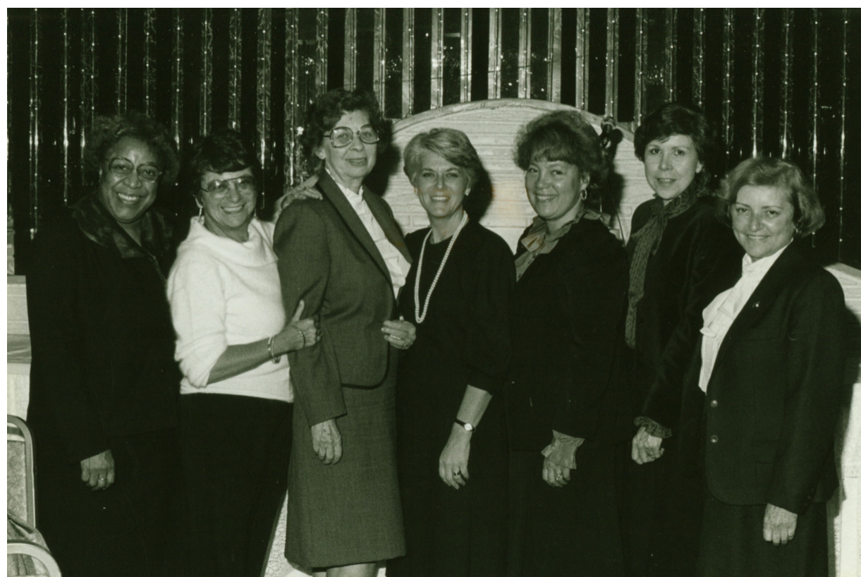
Ferraro with members of the Queens County Women's Bar Association, November 1983.